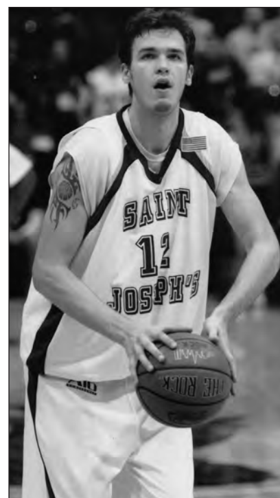
Pat Calathes bettered Delonte West's mark for consecutive free throws by making 38 in a row during the 2006-07 season.