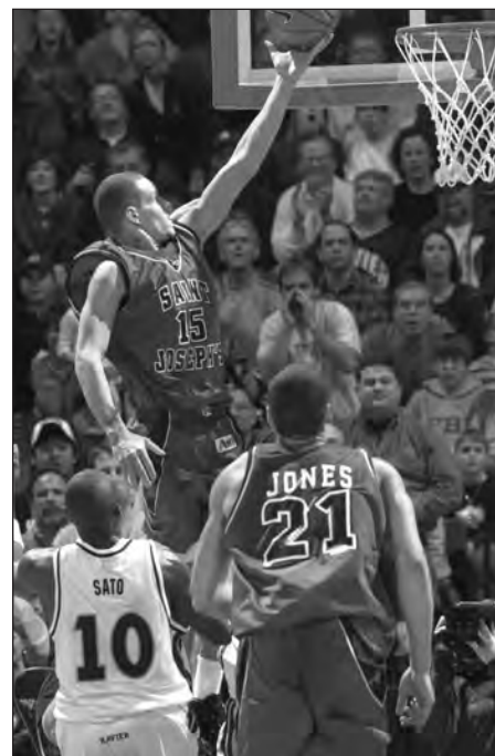
Delonte West had the "perfect game" at Xavier on Jan. 17, 2004, making all of his shots - 12-for-12 from the field, 3-for-3 from beyond the arc and 6-for-6 from the free throw line.

3,200 Capacity at Alumni Memorial Fieldhouse. SJU has sold out the building 124 times over the past 14 seasons.